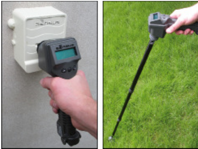
AutoGun touchgun or AutoGun with PitProbe extension can be used as a stand-alone unit for obtaining visual readings from Sensus encoders.

Touchread Meter Reading: TouchRead® System meter readings are more available than ever. Attached to an AutoRead HandHeld Device (AR5501), the AutoGun provides fully automated on-site electronic meter interrogation from TouchRead® System equipped meters. The AutoGun also permits TouchRead® System capability with the following premium grade hand-held meter reading and data collection devices; (Datamatic, Husky-PPS, Itron, Micro Palm, Radix, Syscon).