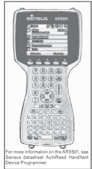
For more information on the AR5501, see Sensus datasheet AutoRead Handheld Device Programmer

© All products purchased and services performed are subject to Sensus' terms of sale, available at either; http://na.sensus.com/TC/TermsConditions.pdf or 1-800-METER-IT. Sensus reserves the right to modify these terms and conditions in its own discretion without notice to the customer.